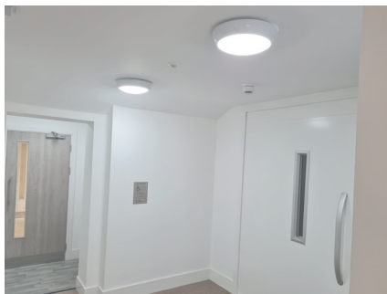
CCECO luminaire corridor installation